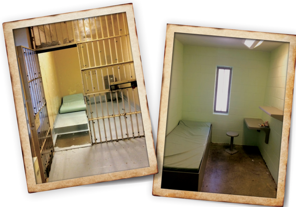
Front cover photo: Door to Block 10 at Thunder Bay Jail, behind which is one segregation cell.